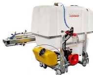
Extra 3rd Tank For Mixer