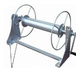
Spraying Hose Wrapping Pulley/100m