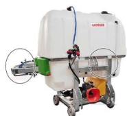
Hot-dip Galvanized Boom and Frame