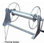
Spraying Hose Wrapping Pulley/100m