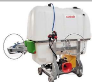
Hot-dip Galvanized Boom and Frame