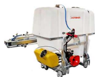
Extra 3rd Tank For Mixer