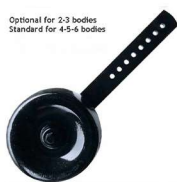
Optional for 2-3 bodies Standard for 4-5-6 bodies