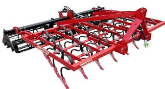
S Tiller Cultivator (Without Folding) 250 to 400 cm Width