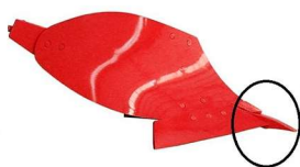
Wedge Blade Type