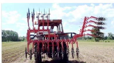
Horizontal Folding System