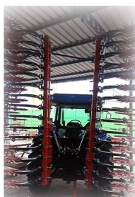
Vertical Folding System