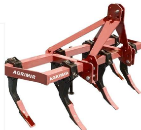
Garden Type Chisel Plough