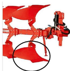
Moulboard Blade Type