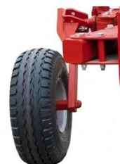
Road And Depth Wheel