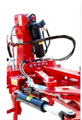
Fully Automatic Rotation System