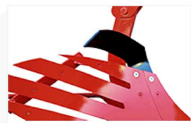
Grid Blade Type