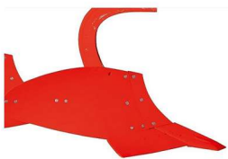
Blade Size (7 to 16 inch)