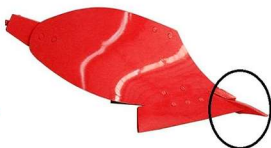
Wedge Blade Type